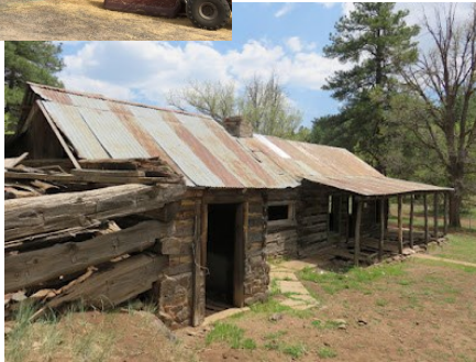
Old Ranch Ruins near Apache Maid Mountain