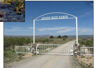
Winter Ranch Entry