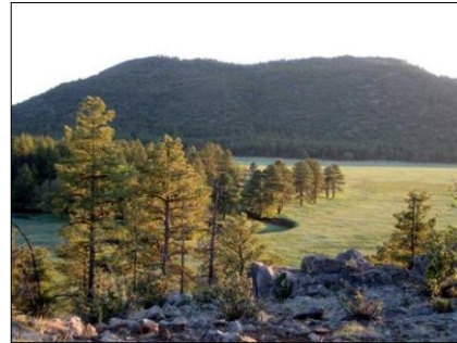
Apache Maid Mountain