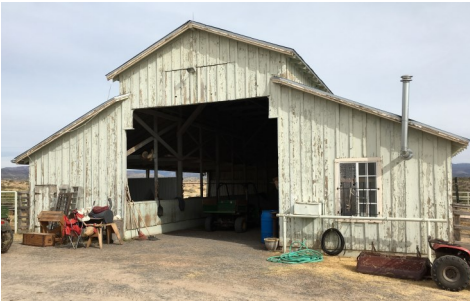
Barn at Lower Ranch