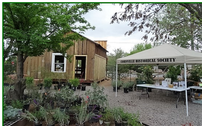
The Historical Society Tent at the Wine, Food and Craft Festival near the historic Cornville Post Office at Windmill Gardens on Cornville Road.