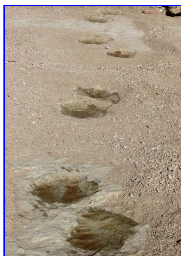
Above: Views of Bee Canyon from above and below Below: Elephant tracks, bee hive, and another track