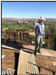
Top: Tearing up flooring & removing a room; sorting, piling, pulling nails and preserving reusable materials. Left: Disturbing roof mouse habitat. Right: Mixing cement & pouring footers .