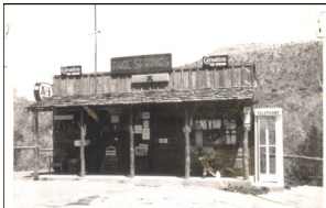
Page Springs Store in 1950's

For a time in the late 1950's, it became a part of the main travel route between Phoenix and Flagstaff, while I-17 was being built. It was then that Page Springs Store (later a restaurant) and Casey's Corner Store (now a store & restaurant) were established.