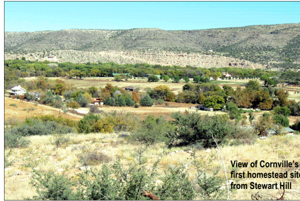
View of Cornville's first homestead site from Stewart Hill

Page Springs Road is a lasting symbol of a pioneer time in a rural place, reflecting the community's history while also providing a passage to the future.