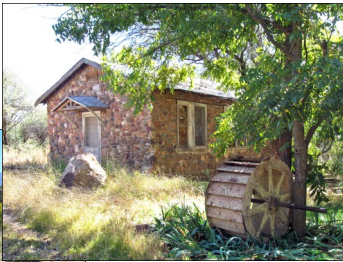
Little Rock Church & School (above) and Historic Gravesites (left) not far from Page Springs Road

Families of original settlers still call Cornville home; and the area retains a strong rural sense of place. In the face of growth and the fast pace of today's society, Page Springs Road is a reminder of the days of Sunday drives and big family dinners. Now, the road offers travelers an opportunity to relive those lost times.