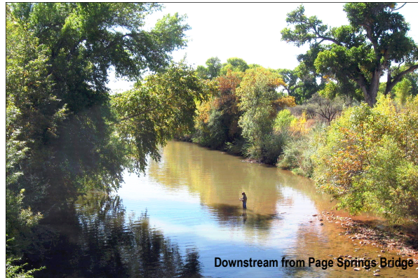
Downstream from Page Springs Bridge